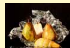
"Yellow Pears on Foil", Laurin McCracken