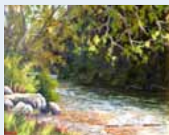
"Yellow Breeches from McCormicks Rd", Ralph Hocker