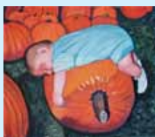
"Pumpkin Boy" by Ann Shull