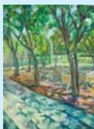
"Kimbell Museum Steps"