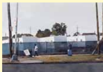
"New Orleans 9th Ward", Dean Mitchell

Thirty-five works of art created by nationally recognized artists from 12 states were included in our 5th Annual Keystone National Juried Exhibition of Works on Paper September 25 to October 21, 2011.